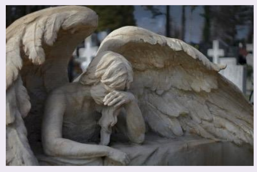
Grief Support Group